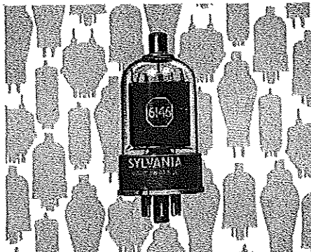
Guide to Popular Sylvania Power Tubes

Keep your mobile units on the road—replace with Sylvania Power Tubes. For prompt service, just phone your Sylvania Industrial Tube Distributor. Ask him for the "Sylvania Industrial Tubes" booklet. Or write Electronic Tubes Division, Sylvania Electric Products Inc., Dept. 117, 1100 Main Street, Buffalo, N. Y.